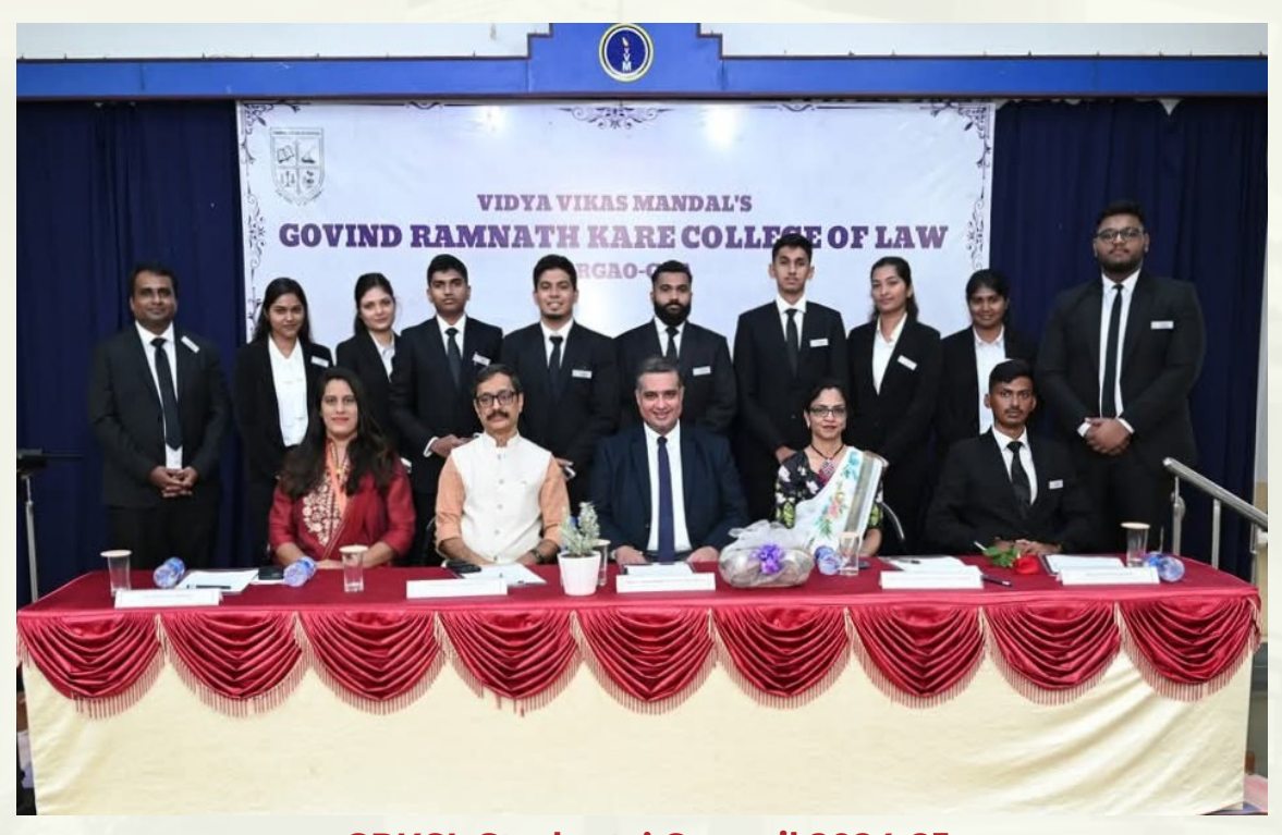
GRKCL Students' Council 2024-25