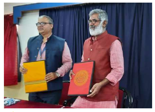
MoU with MIT School of Government Pune, Maharashtra

Looking back at its glory, the Institution has given to the society and community, alumni whose services to society has been laudable and who presently occupy eminent positions in various and diverse arenas of legal and social life. Besides this, the institutional performance at the University examinations is consistently outstanding. The Institution prides itself for the several gold medals and recognitions earned at the University Examinations as also at the various State level competitions in curricular, co-curricular, extra-curricular and sports activities.