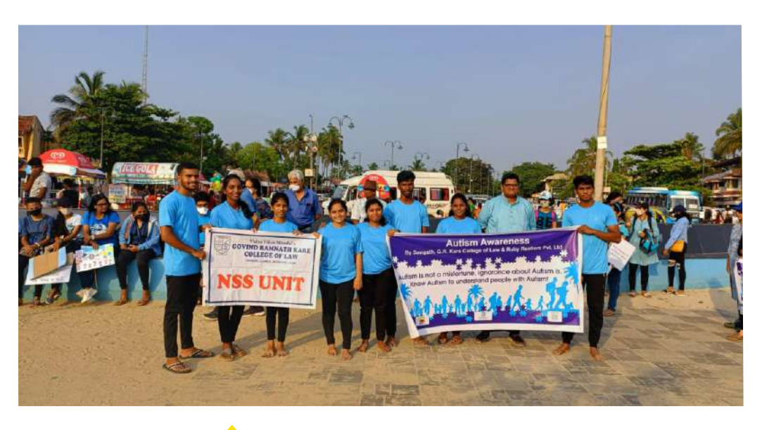
NSS Unit - Autism Awareness rally

The Principal shall be available from 8:30 a.m. to 9:30 a.m. without prior appointment. Visitors are required to seek an appointment to meet the Principal at all other times