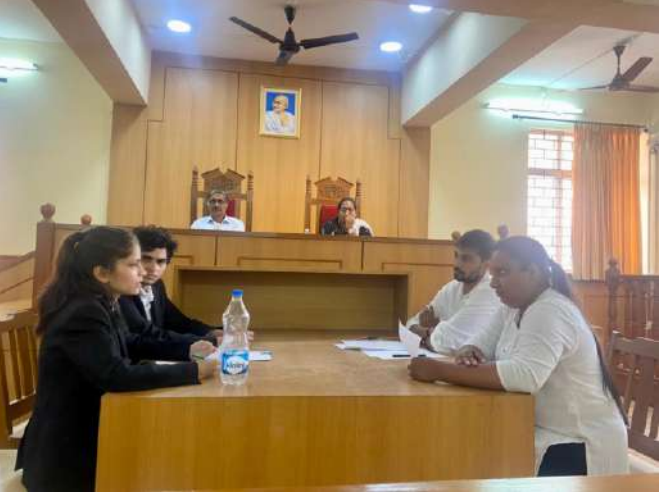
PRATIBHA 22 - Intercollegiate Cultural, Sports and Literary Event