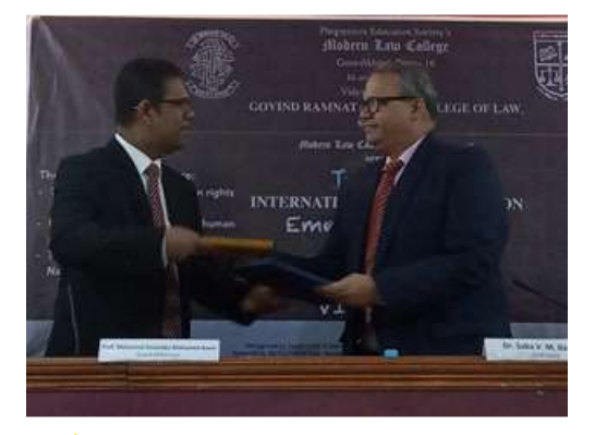
School of Legal Studies, British College of Applied Studies, Colombo, Sri Lanka