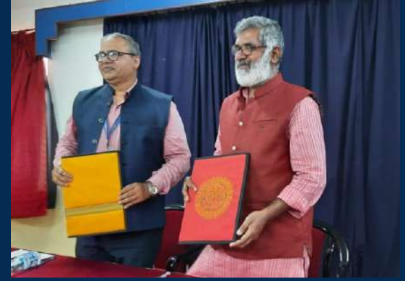
Signing of MoU with MIT Pune