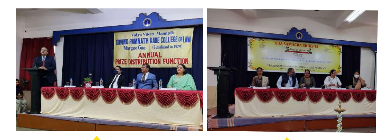
Annual Prize Distribution Function

The Goa Prohibition of Smoking and Spitting Act, 1997 prohibits smoking and spitting in the premises and on the campus.