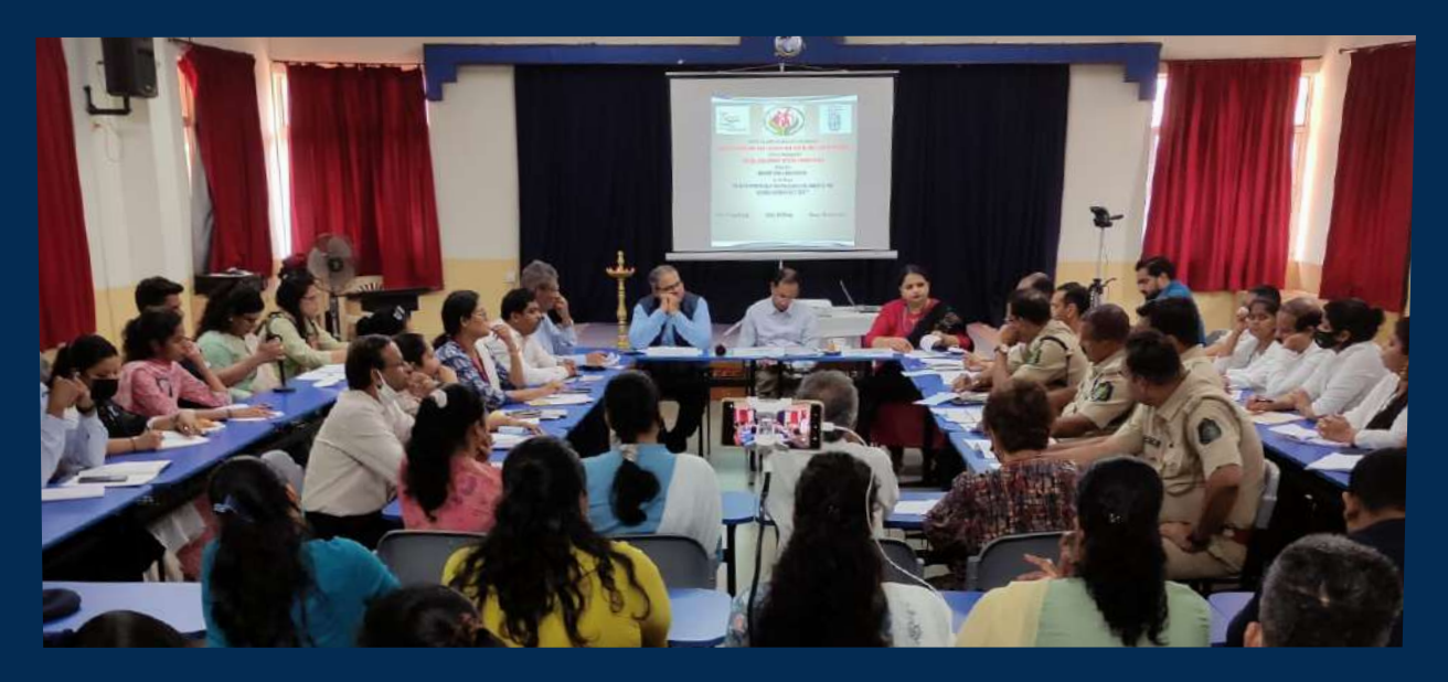
A Roundtable Conference on implementation of The Maintenance of Parents and Senior Citizens Act 2007