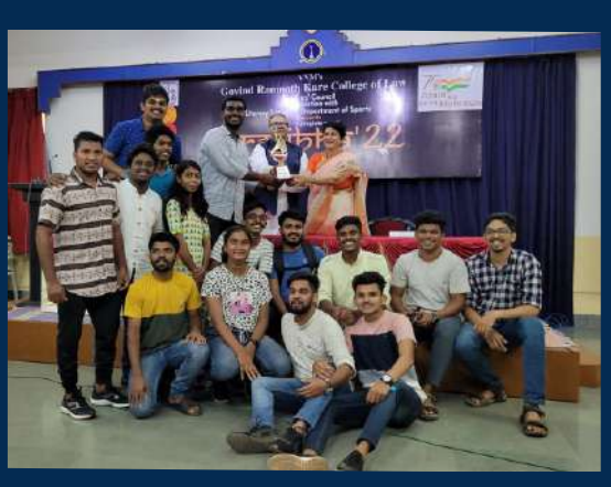
Winners of Pratibha 2022 Intercollegiate Cultural Literary and Sports Festival