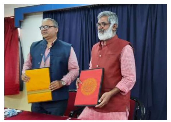
MoU with MIT School of Government Pune, Maharashtra

Looking back at its glory, the Institution has given to the society and community, alumni whose services to society has been laudable and who presently occupy eminent positions in various and diverse arenas of legal and social life. Besides this, the institutional performance at the University examinations is consistently outstanding. The Institution prides itself for the several gold medals and recognitions earned at the University Examinations as also at the various State level competitions in curricular, co-curricular, extra-curricular and sports activities.