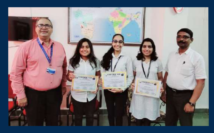
Winners of V M Salgaocar Memorial National Moot Court Competition 2022