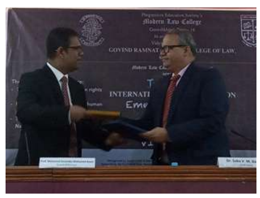
School of Legal Studies, British College of Applied Studies, Colombo, Sri Lanka