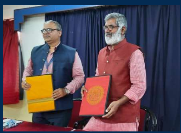
Signing of MoU with MIT Pune