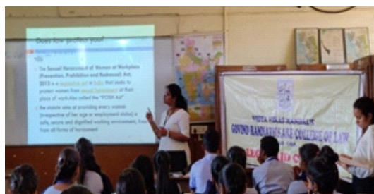
Legal awareness programme by members of Legal Aid Clinic

The Child Rights Cell of the College conducts awareness of the rights of the child through programmes and encourages students and faculty members to publish research articles and literature on the rights of the child.