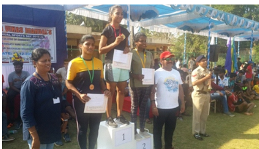
▶ Annual Sports meet 2019-20