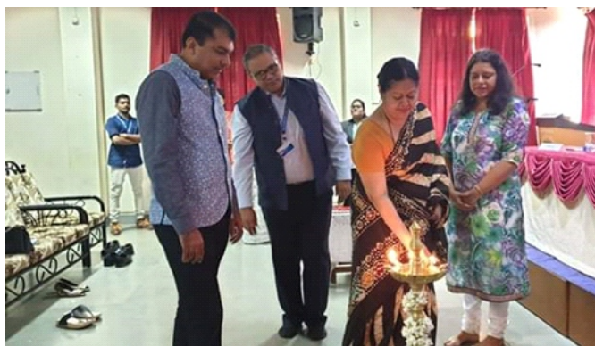
Law Day celebration in association with Goa State Legal Services Authority

The Goa Prohibition of Smoking and Spitting Act, 1997 prohibits smoking and spitting in the premises and on the campus