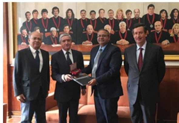
▲ MoU with University of Lisbon, Portugal