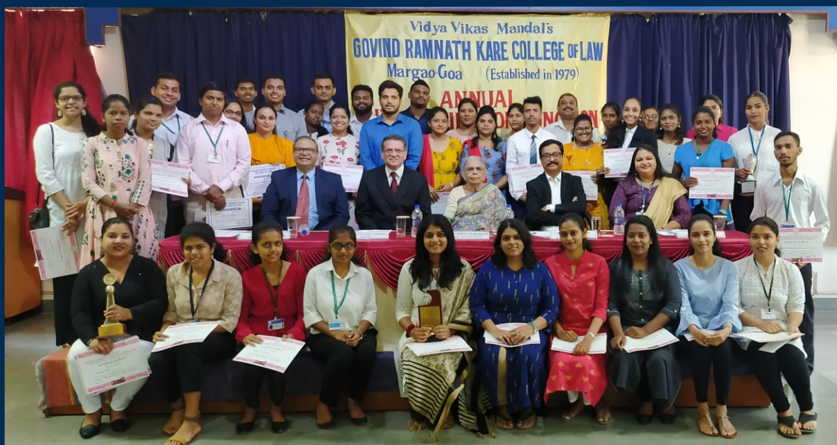
▲ Annual prize distribution day 2019-20