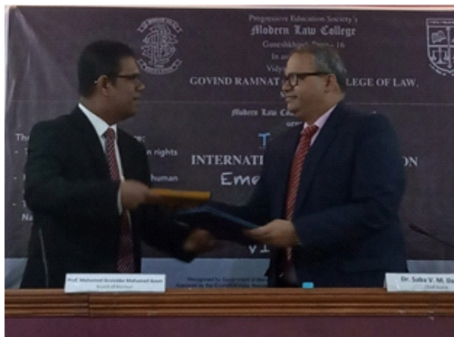
▲ School of Legal Studies, British College of Applied Studies, Colombo, Sri Lanka