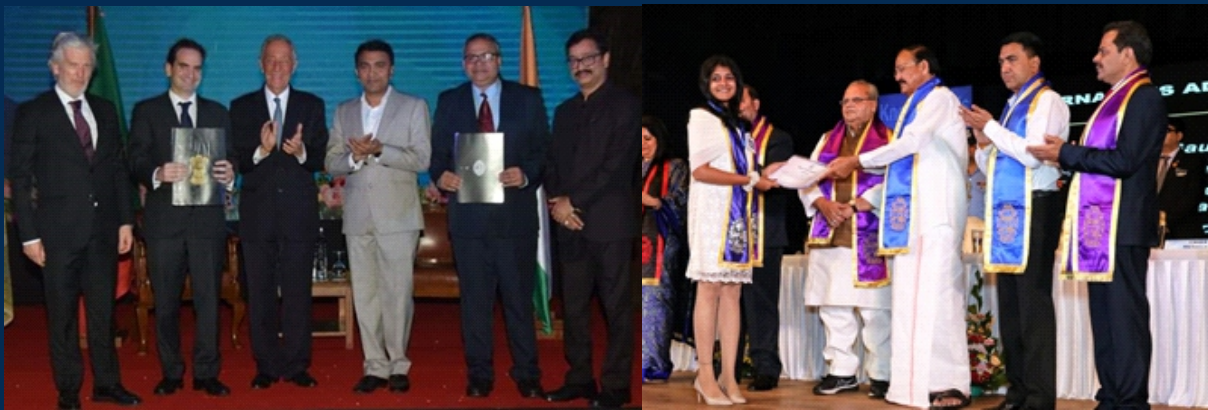
▲ MoU with the Coimbra University, Portugal in presence of H.E. the President of Portugal, Mr. Marcelo Rebelo De Souza, Hon'ble Chief Minister of Goa, Dr. Pramod Sawant and officials of The University Of Coimbra.