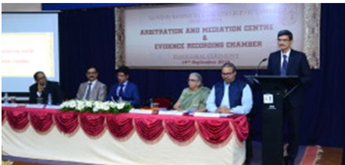
▲ Inauguration of Arbitration and Mediation centre and Evidence recording chamber at the hands of Hon'ble Justice C. V. Bhadang, Judge, High Court of Bombay at Goa.

Authorized to take disciplinary action and conduct inquiries against any student who is found to employ unfair means during internal examinations conducted by the college