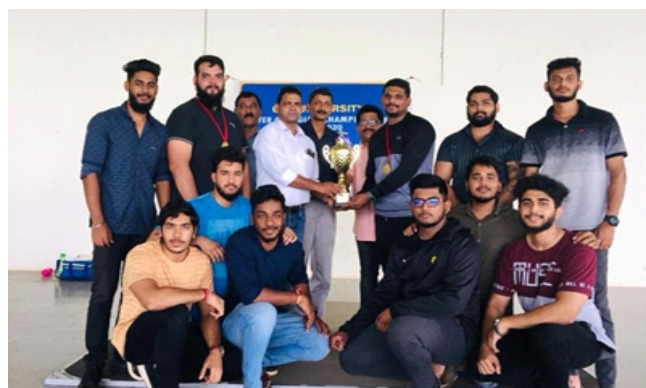
▶ Runners up at Inter-Collegiate Power Lifting championship 2019-20 organised by Goa University