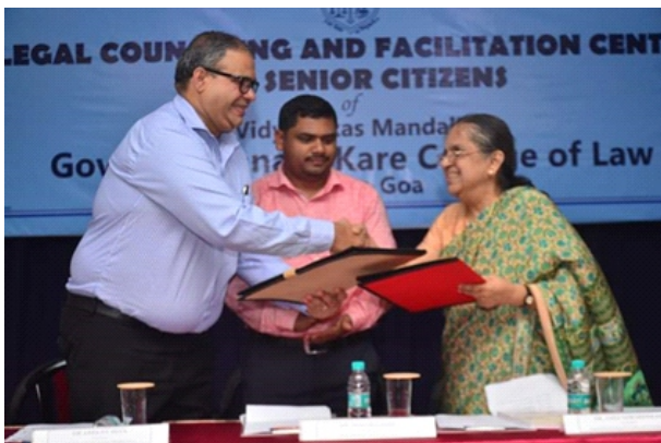
▲ MoU with Sanjeevan society for youth development, Bandora

Looking back at its glory, the Institution has given to the society and community, alumni whose services to society has been laudable and who presently occupy eminent positions in various and diverse arenas of legal and social life. Besides this, the institutional performance at the University examinations is consistently outstanding. The Institution prides itself for the several gold medals and recognitions earned at the University Examinations as also at the various State level competitions in curricular, co-curricular, extra-curricular and sports activities.