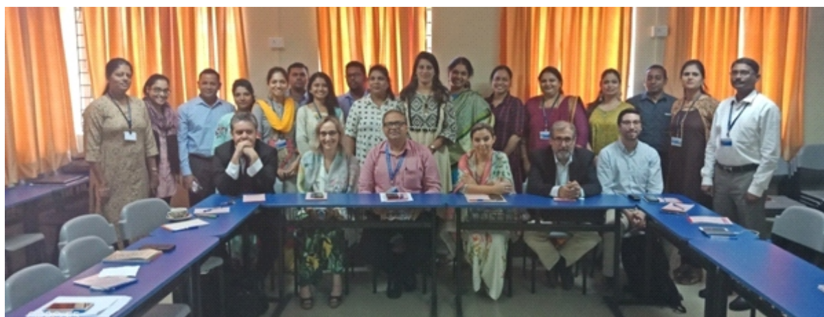
▲ Interaction with Faculty members of University of Minho, Portugal

Rs. 3,500 /- (75% Refundable at the time of leaving the college)