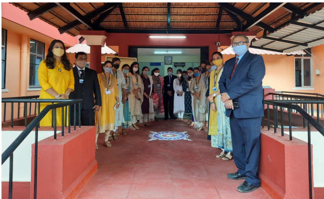
▲ Faculty awaiting NAAC Peer Team

A student who wishes to cancel his/her admission will be eligible for refund of fees as per the Rules laid down by the Goa University and notified from time to time.