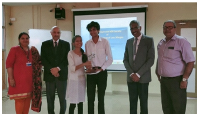
▲ Winners of Intra-collegiate Mediation competition

The cell aims at skill development of the employees of the institution. It conducts professional development programmes for employees and undertakes training of skill development of the employees, including that of support staff..