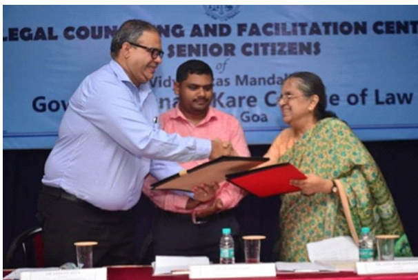
▲ MoU with Sanjeevan society for youth development, Bandora

Looking back at its glory, the Institution has given to the society and community, alumni whose services to society has been laudable and who presently occupy eminent positions in various and diverse arenas of legal and social life. Besides this, the institutional performance at the University examinations is consistently outstanding. The Institution prides itself for the several gold medals and recognitions earned at the University Examinations as also at the various State level competitions in curricular, co-curricular, extra-curricular and sports activities.