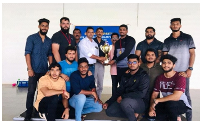
Runners up at Inter-Collegiate Power Lifting Championship 2019-20 organised by Goa University