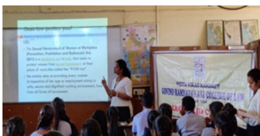
Legal awareness programme by members of Legal Aid Clinic

The Child Rights Cell of the College conducts awareness of the rights of the child through programmes and encourages students and faculty members to publish research articles and literature on the rights of the child.