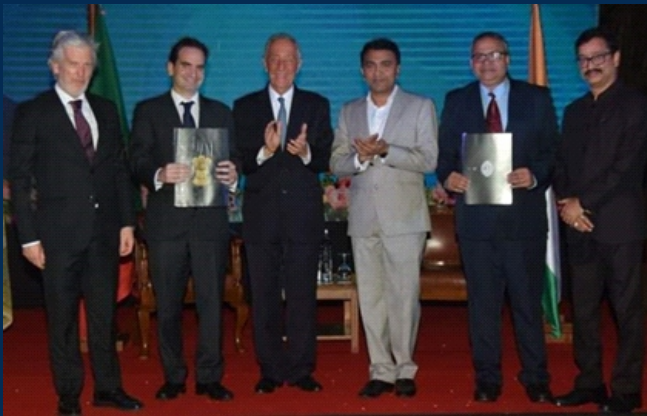
▲ MoU with the Coimbra University, Portugal in presence of H.E. the President of Portugal, Mr. Marcelo Rebelo De Souza, Hon'ble Chief Minister of Goa, Dr. Pramod Sawant and officials of The University Of Coimbra.