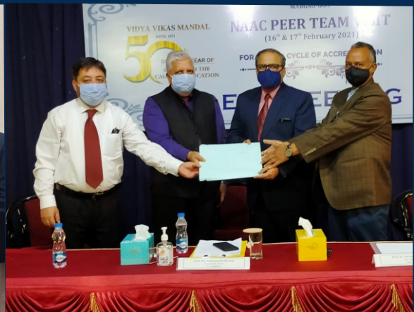
▲ NAAC Exit Meeting