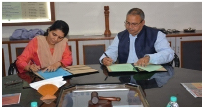
▲ MoU with Modern Law College, Pune