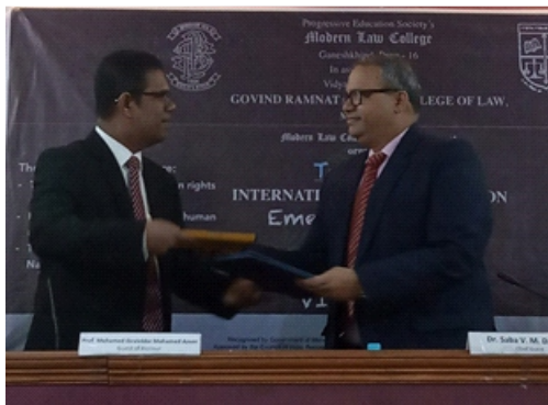
▲ School of Legal Studies, British College of Applied Studies, Colombo, Sri Lanka