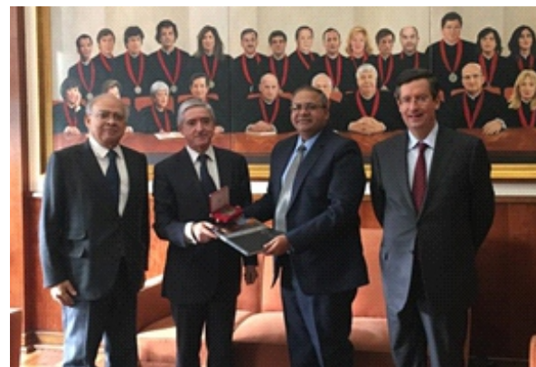
▲ MoU with University of Lisbon, Portugal