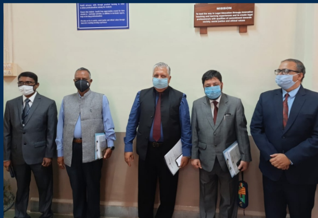
▲ NAAC Peer Team visit - February 2021